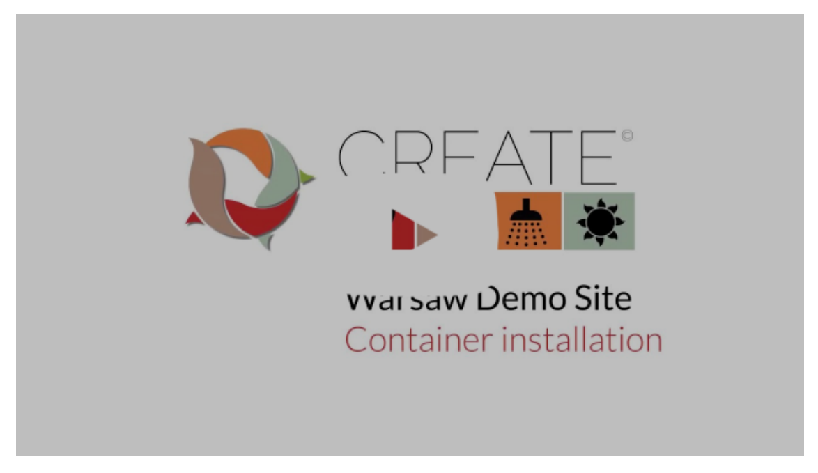
The CREATE container being installed at the Warsaw demo site.

The container with 3 storage modules has been transported from the <u>AEE INTEC</u> laboratory to Warsaw and installed at the demo site . Watch the video from the container installation!